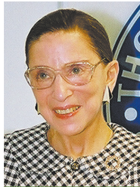
Justice Ruth Bader Ginsburg