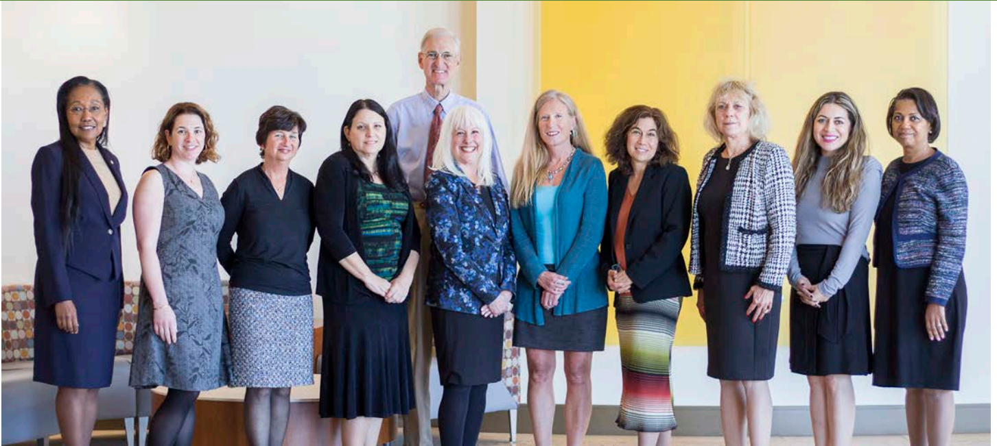
2018 Conference Organizers and Speakers for Her Place at the Bargaining Table: Gender, Negotiation and “Risky” Decision-Making