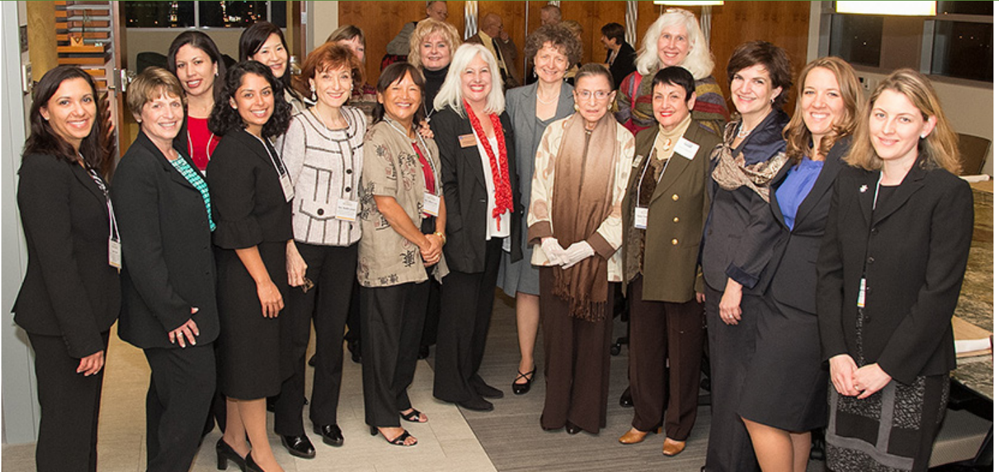
2013 Conference Organizers and Speakers for Her Honor: Women in the Judiciary