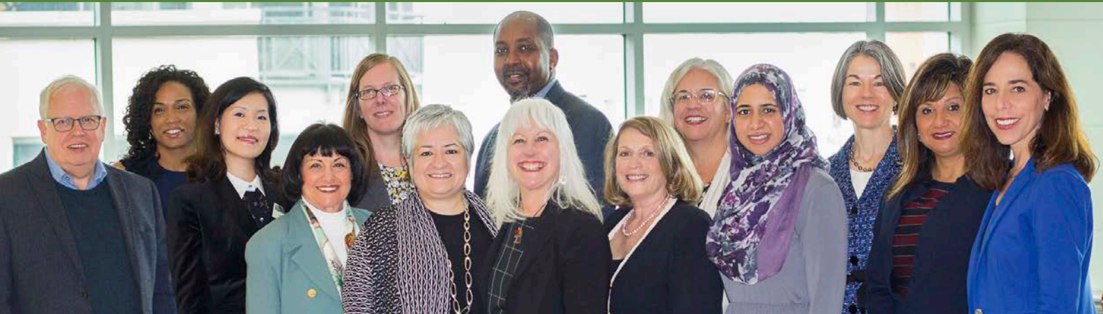
2017 Conference Organizers and Speakers for Pursuing Inclusion: Diversity in the Workplace