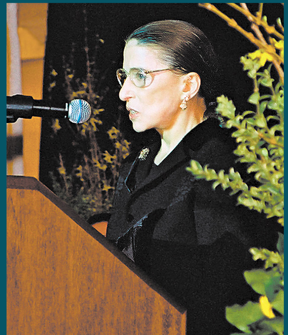
Justice Ruth Bader Ginsburg

The Women and the Law Conference is unique in its early interdisciplinary approach and its commitment to bridging the gap between the teaching academy and the practicing bar.