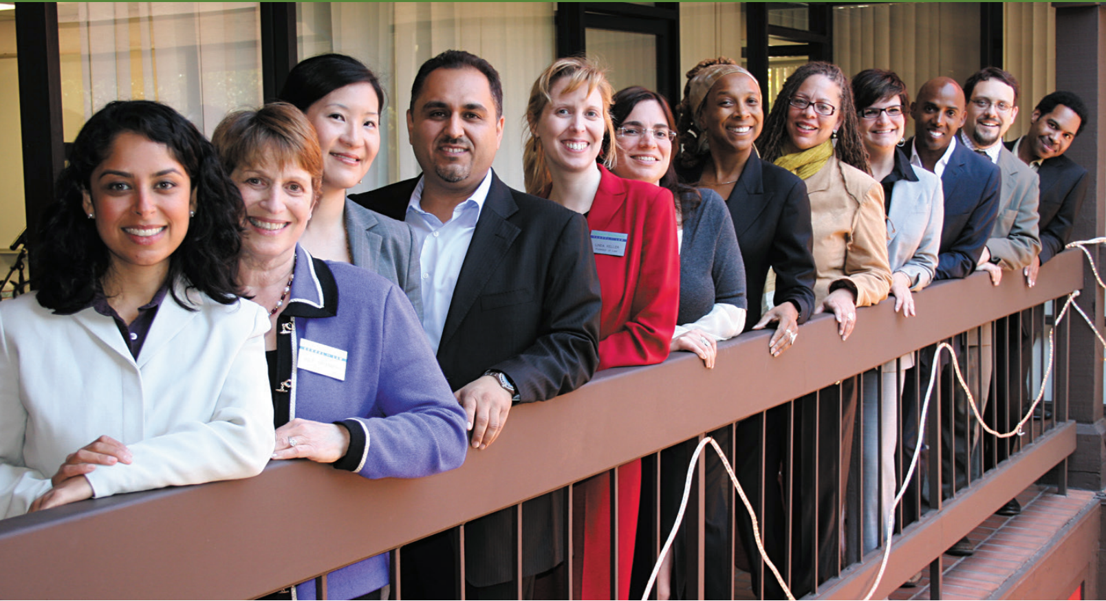
2010 Conference Organizers and Speakers for Women of Color and Intersectionality