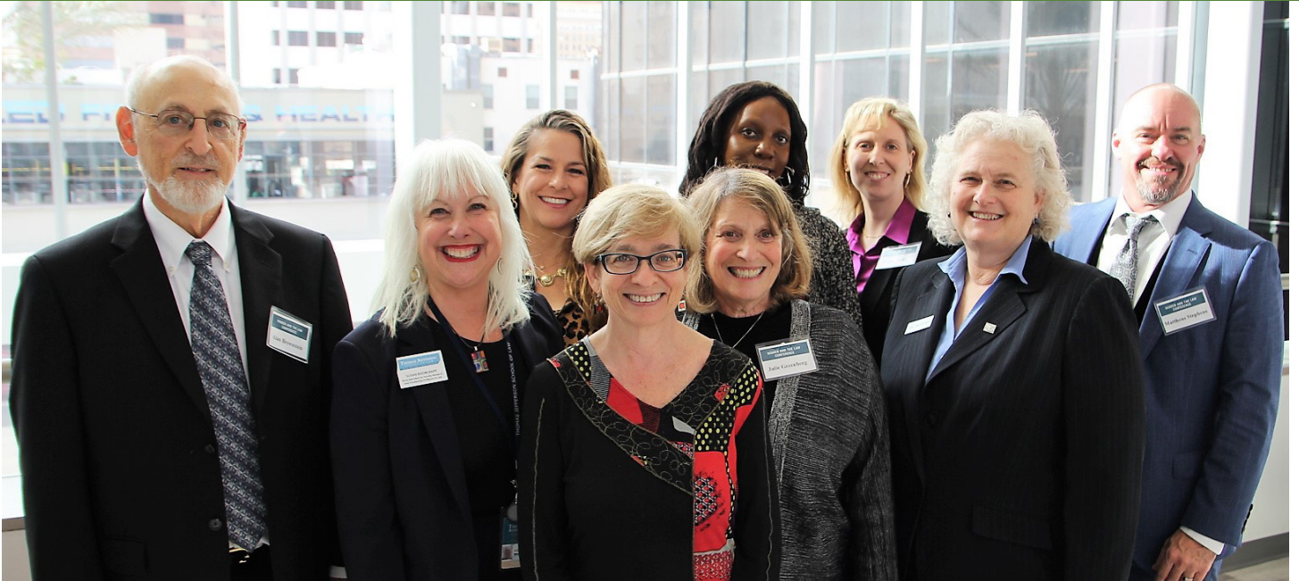
2019 Conference Organizers and Speakers for The Way Forward: Gender, LGBTQIA Rights, and Religious Liberties