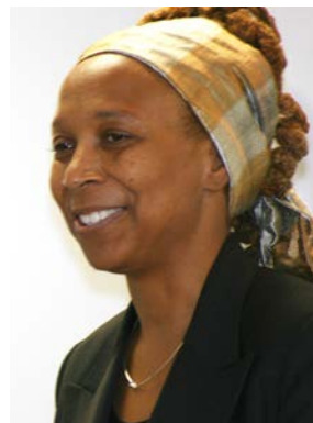
Professor Kimberlé Crenshaw