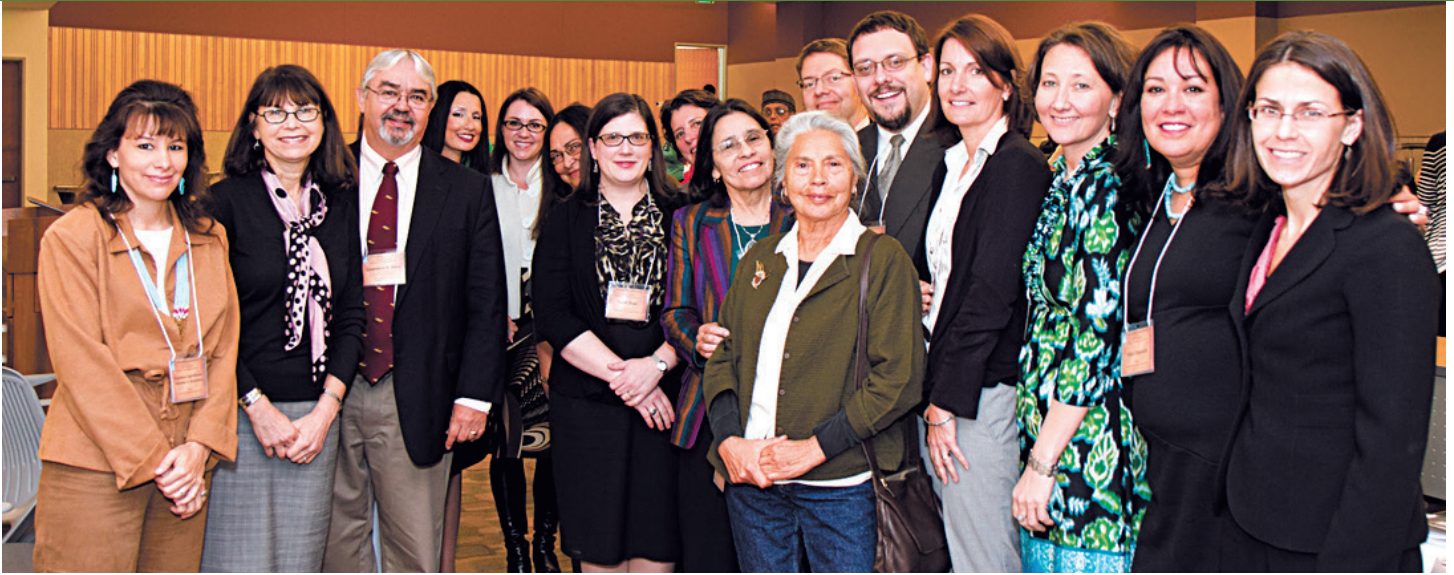
2011 Conference Organizers and Speakers for Gender Justice and Indian Sovereignty: Native American Women and the Law