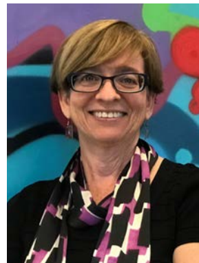
Commissioner Chai Feldblum

The conference in 2018 focused on the theme Her Place at the Bargaining Table: Gender, Negotiation and “Risky” Decision-Making. This event convened leading experts and practitioners to focus on issues related to gender and the law to address the issue of women at the bargaining table: how does gender affect the way we approach and manage negotiations in a variety of settings? Explorations into the enduring wage gap between men and women prompted us to examine this important topic. Despite advances, women on average continue to earn roughly eighty cents for each male dollar earned. Negotiation experts maintain that women’s antipathy to negotiation and risk-taking provides a partial explanation. 2018’s conference explored women and decision-making, with particular attention paid to the art and science of bargaining for advantage. Professor Linda C. Babcock, the James M. Walton Professor of Economics at Carnegie Mellon University, delivered the Ruth Bader Ginsburg Lecture.