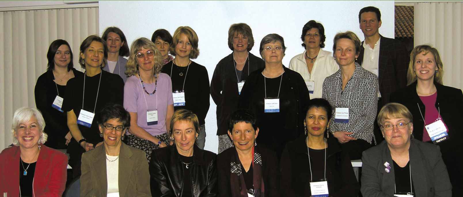
2005 Conference Organizers and Speakers for The Global Impact of Feminist Legal Theory