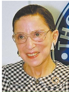
Justice Ruth Bader Ginsburg