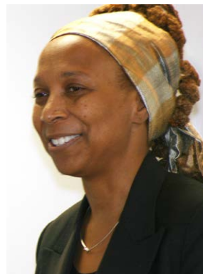
Professor Kimberlé Crenshaw