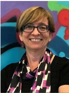
Commissioner Chai Feldblum

The 2019 conference, The Way Forward: Gender, LGBTQIA Rights, and Religious Liberties , brings together leading experts and practitioners to discuss critical federal and state legislative, executive, and judicial developments affecting women, the LGBTQIA community, and people concerned about religious liberties. At a time when