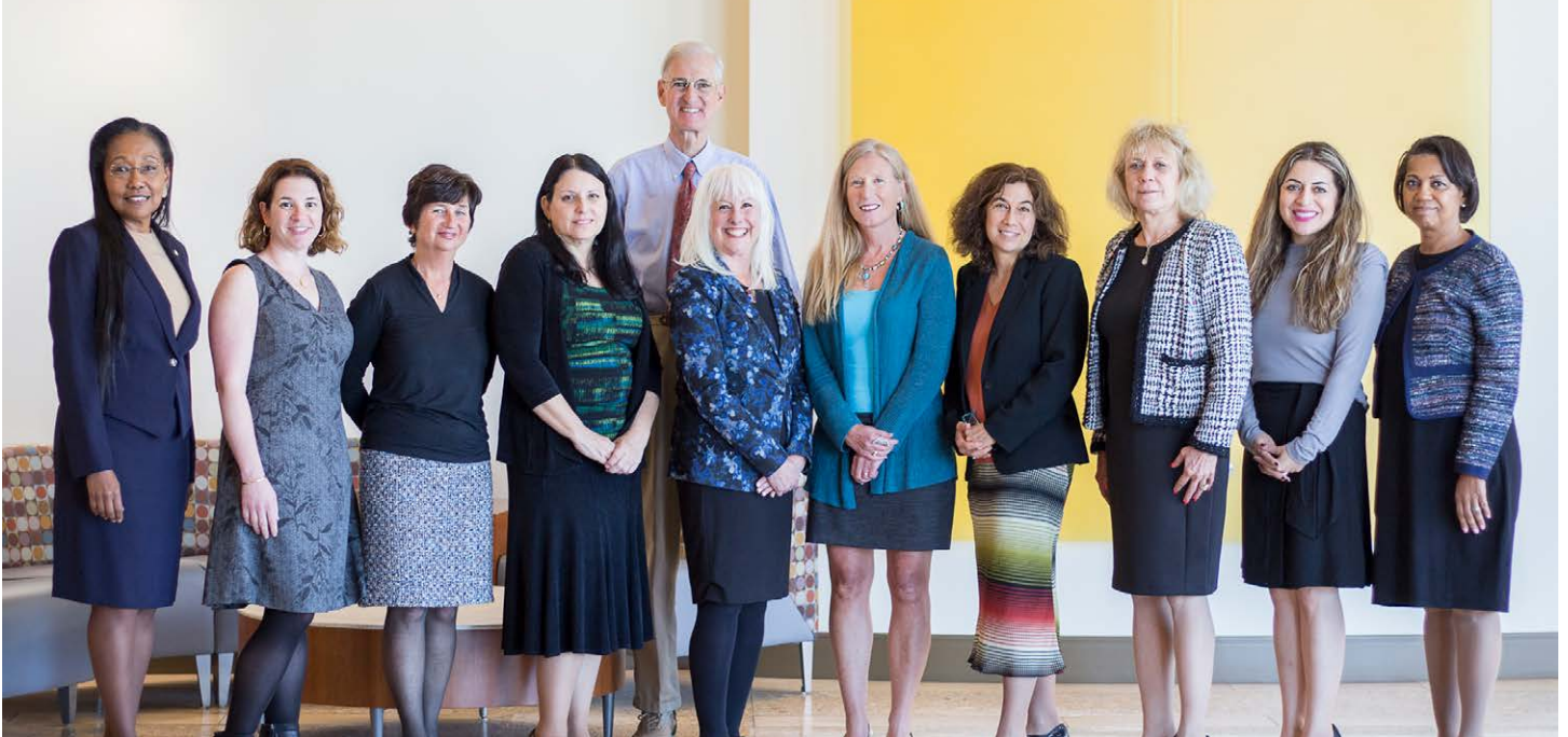
2018 Conference Organizers and Speakers for Her Place at the Bargaining Table: Gender, Negotiation and “Risky” Decision-Making