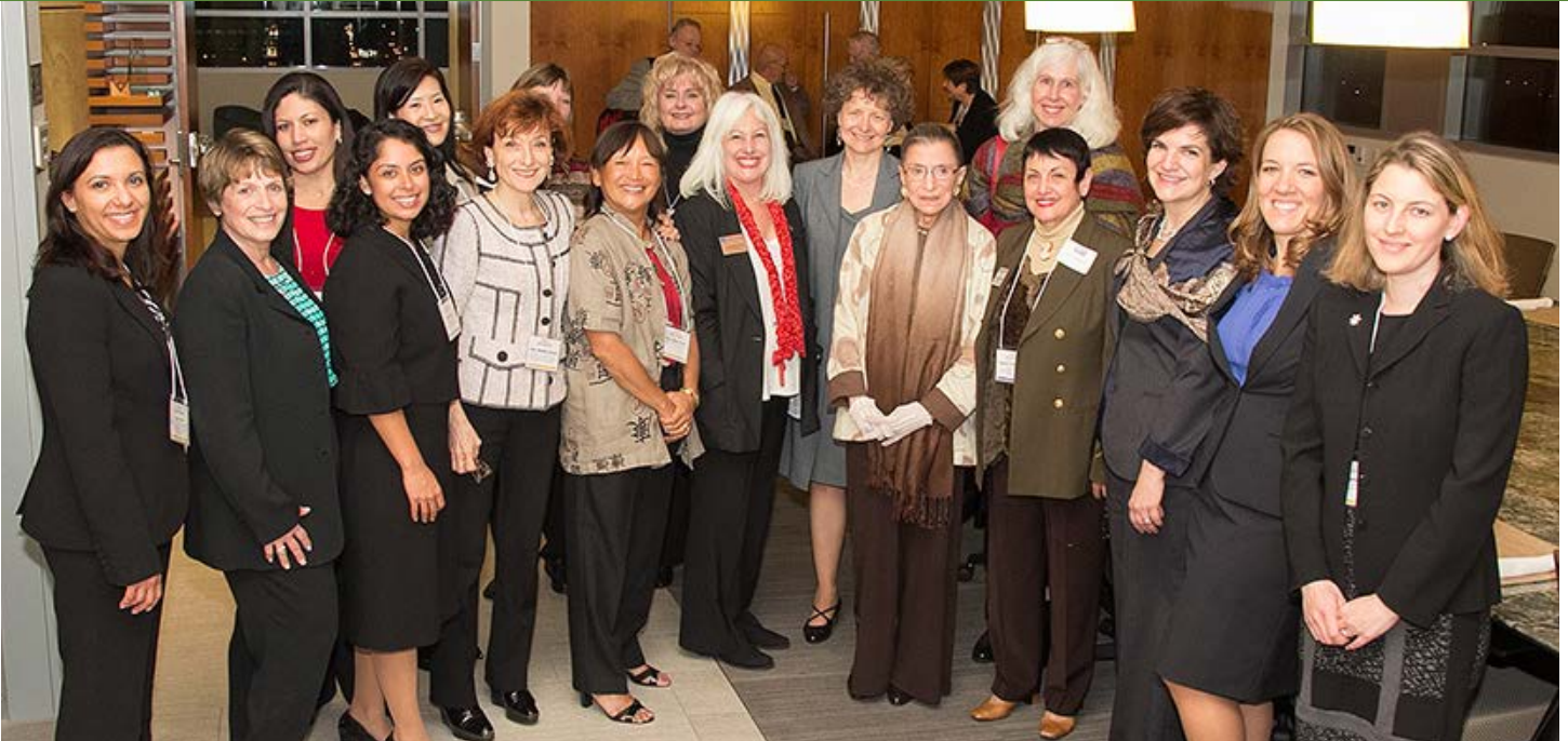
2013 Conference Organizers and Speakers for Her Honor: Women in the Judiciary