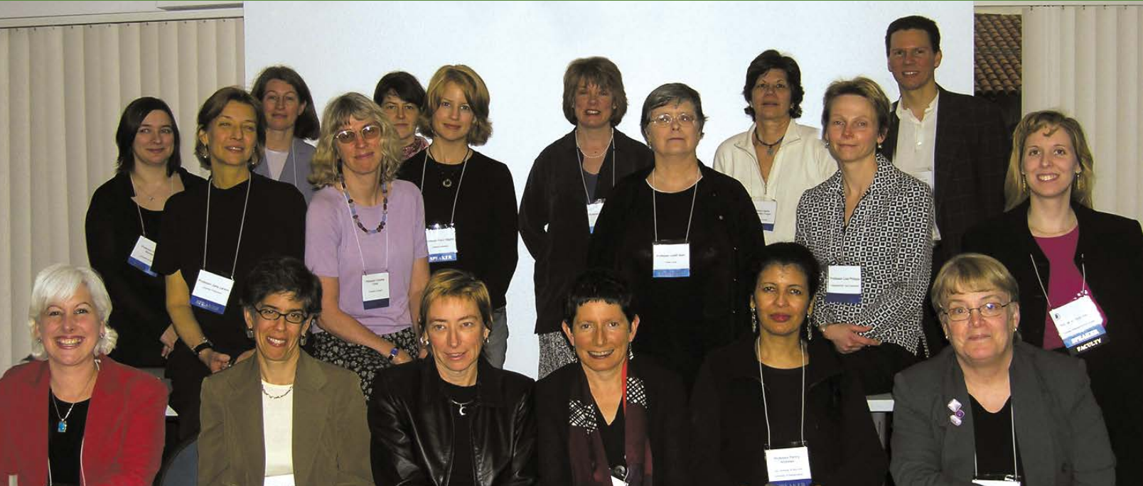
2005 Conference Organizers and Speakers for The Global Impact of Feminist Legal Theory