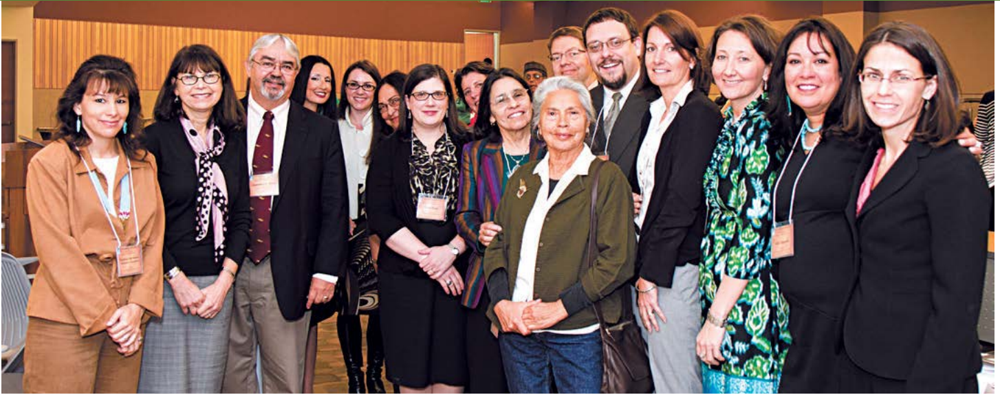
2011 Conference Organizers and Speakers for Gender Justice and Indian Sovereignty: Native American Women and the Law