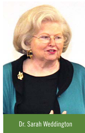
Dr. Sarah Weddington