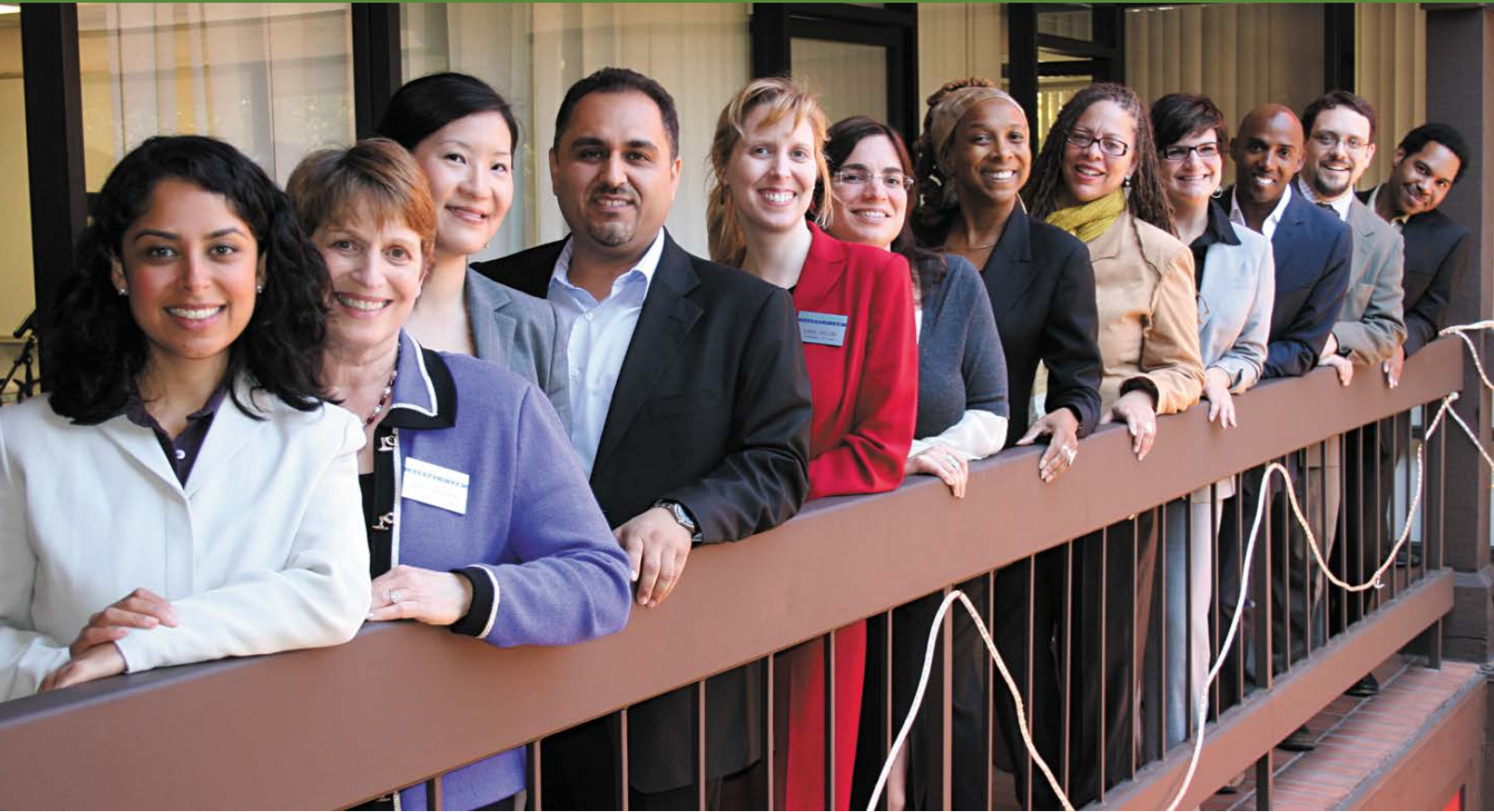
2010 Conference Organizers and Speakers for Women of Color and Intersectionality