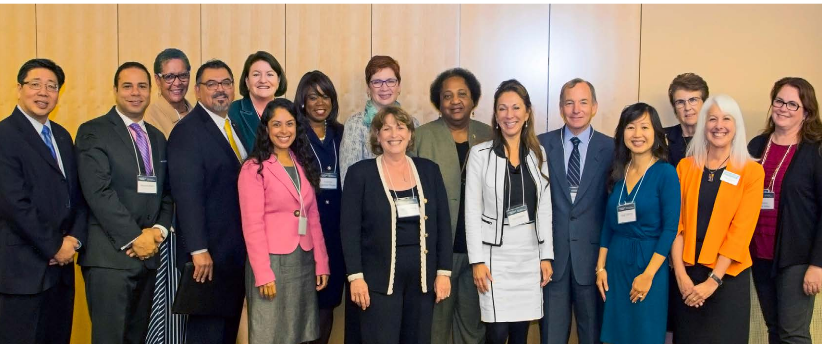
2016 Conference Organizers and Speakers for Pursuing Excellence: Diversity in Higher Education

In 2015 , the conference explored Women and the Criminal Justice System. Noted criminal defense attorney and author Leslie Abramson, who handled the Menendez Brothers trial and the Phil Spector case, delivered the Ruth Bader Ginsburg Lecture, "Using Female Strength to Your Client's Advantage." Conference speakers included judges, prosecuting attorneys, defense attorneys, civil rights attorneys, academics, and former inmates, who examined gender disparities in prison and throughout the criminal justice system.